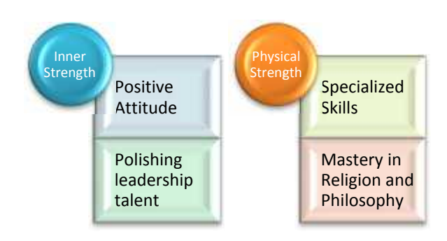
Figure 1: Characteristics of the Education System found in Dayah

Dayah residents involved with the development of Aceh directly. Despite being busy with their studies, dayah still take the time to study the problems that arise in society. Dayahs, especially teungku, will lead the local community to carry out an activity or task related to the public interest. For example, cultivating crops, building irrigation systems, building bridges, roads and and developing mosques.<sup>18</sup>